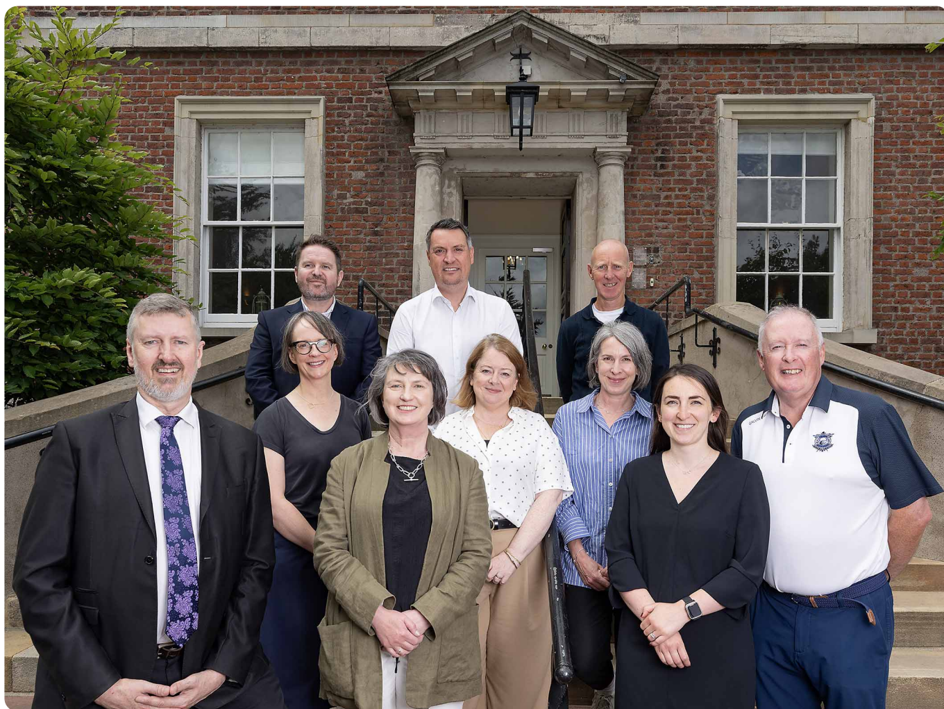
Halifax Foundation Trustees